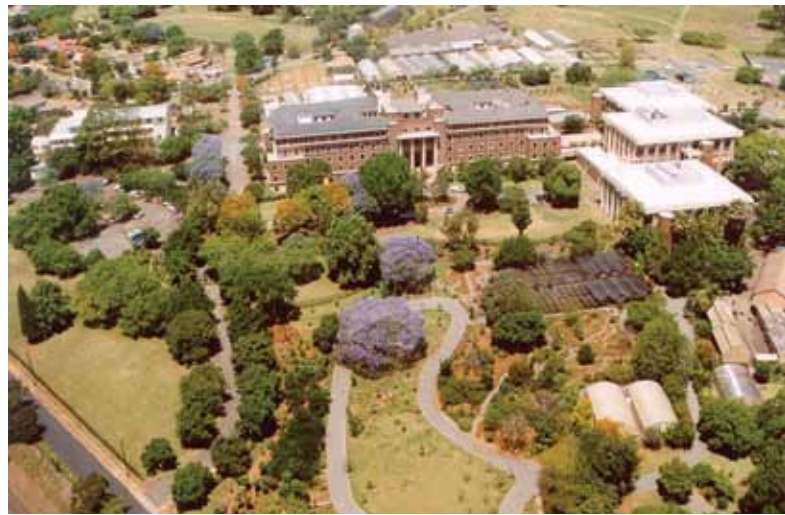
An aerial view of the Rabie Saunders Building.