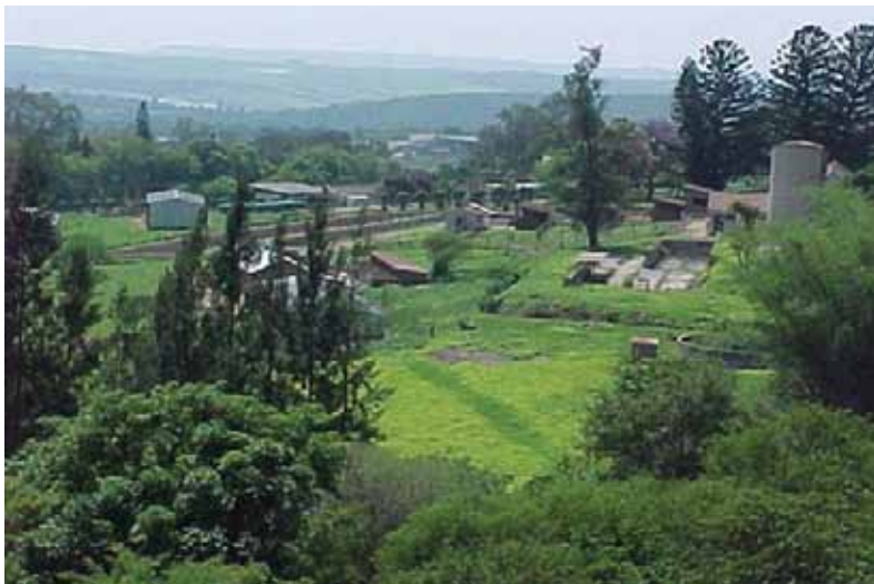
UKZN's Ukulinga Research Farm.

Ukulinga has been the site of unique and ground-breaking research in several agricultural disciplines. The Veld Fertilisation Trial and the Burning and Mowing Trial started in 1951 and have continued uninterrupted, while in 1960 there was revolutionary research which involved the use of rabbits as intermediate living incubators to transport fertilised ova from ewes in England to South Africa where they were successfully transferred into