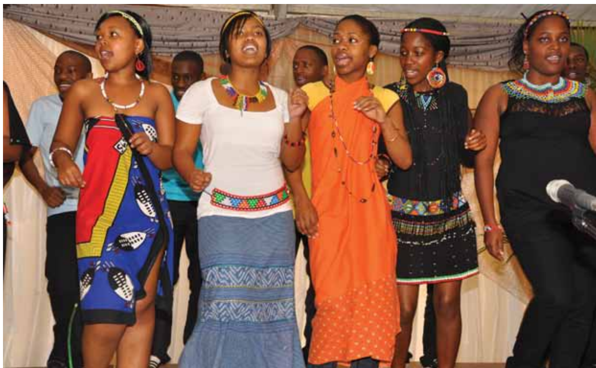
Medical School students celebrate cultural diversity.