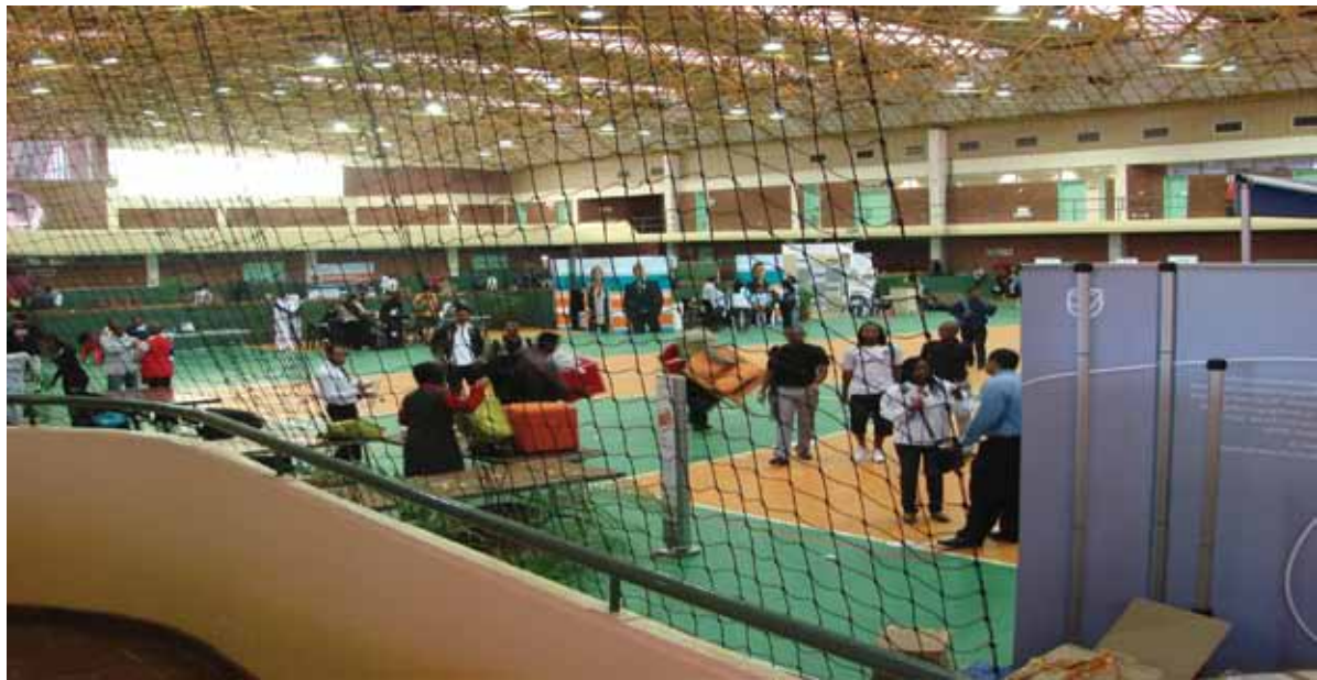
Local and international employers attracted UKZN students to a career exhibition at the Sports Complex on the Westville campus on August 4.